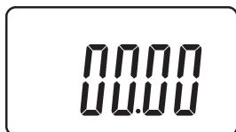
Total Using Time (YY.MM)