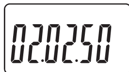
Total Using Time (DD.HH.MM)